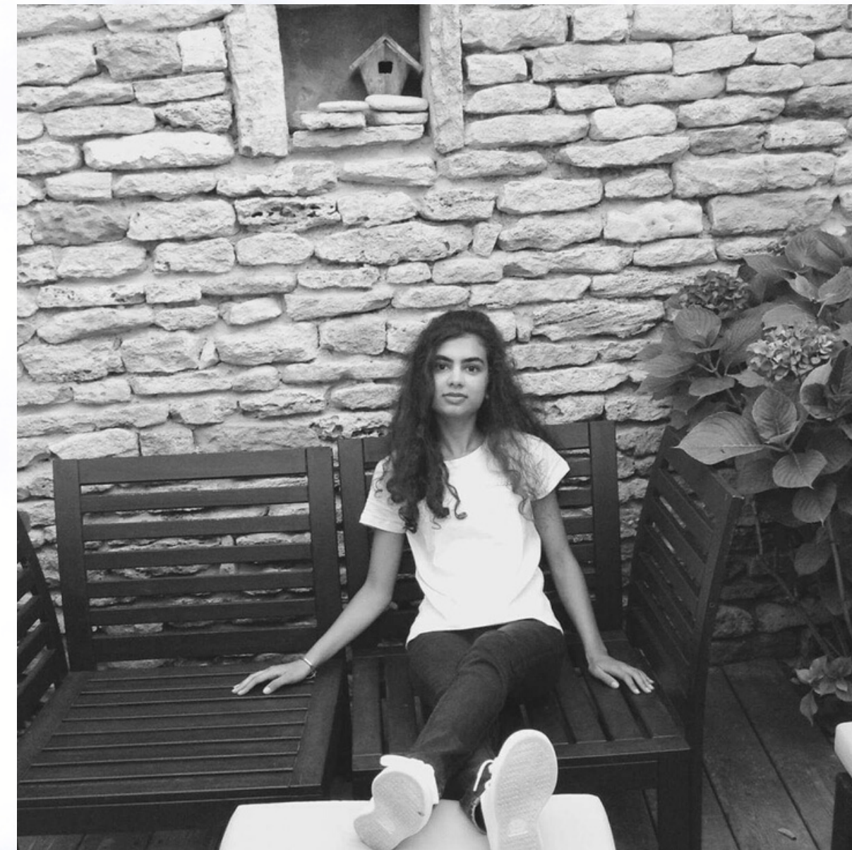
Monochrome and more casual during the Summer