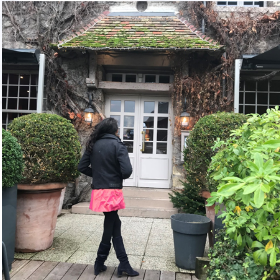
Feminine and festive on my 21st birthday

Culture is thus dear to fashion which underscores its intimate dimension. Style is a form of expression of who we are and how we feel.